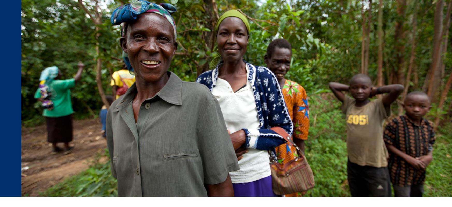
IFAD Country Offices (ICOs)