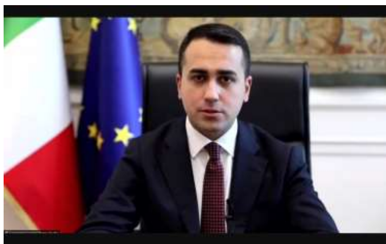
His Excellency Luigi Di Maio, Minister for Foreign Affairs and International Cooperation of the Italian Republic