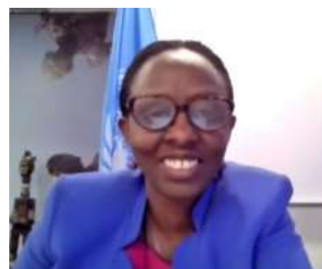
Dr Agnes Kalibata, Special Envoy for the United Nations Food Systems Summit