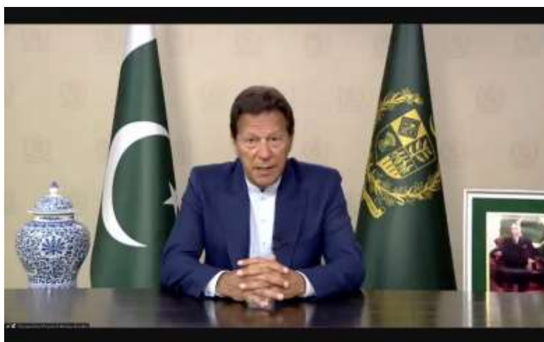
His Excellency Imran Khan, Prime Minister of the Islamic Republic of Pakistan