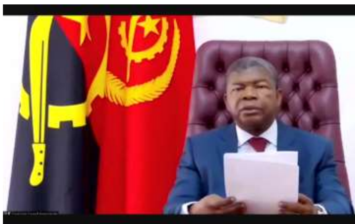
His Excellency João Lourenço, President of the Republic of Angola