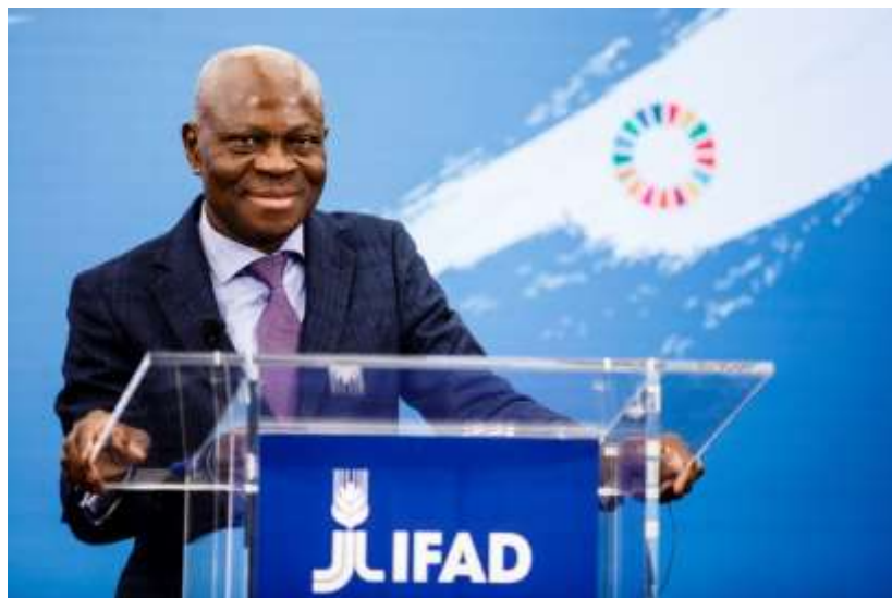
Mr Gilbert Houngbo, President of IFAD