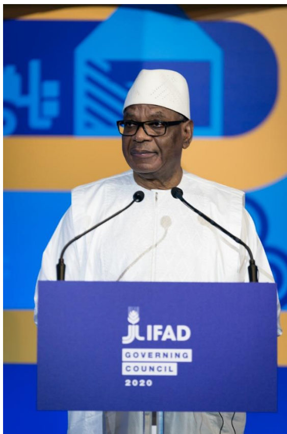
His Excellency Ibrahim Boubacar Keïta President of the Republic of Mali