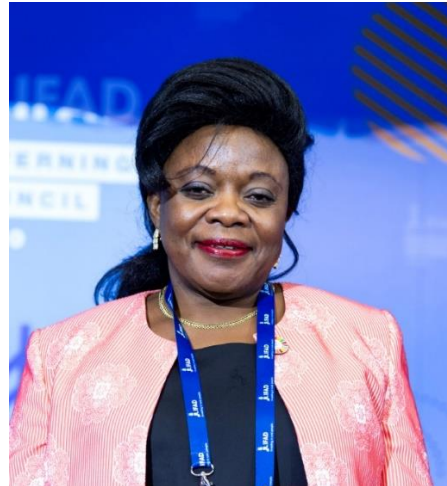
Her Excellency Clémentine Ananga Messina Vice Chairperson of the Governing Council Governor for the Republic of Cameroon