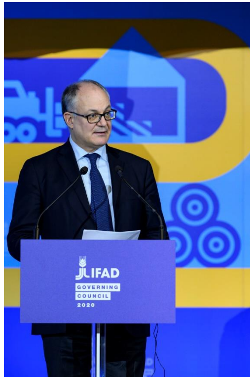
His Excellency Roberto Gualtieri Minister for Economy and Finance of the Italian Republic