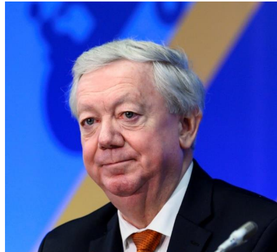
His Excellency Hans Hoogeveen Outgoing Chairperson of the Governing Council, Governor for the Kingdom of the Netherlands