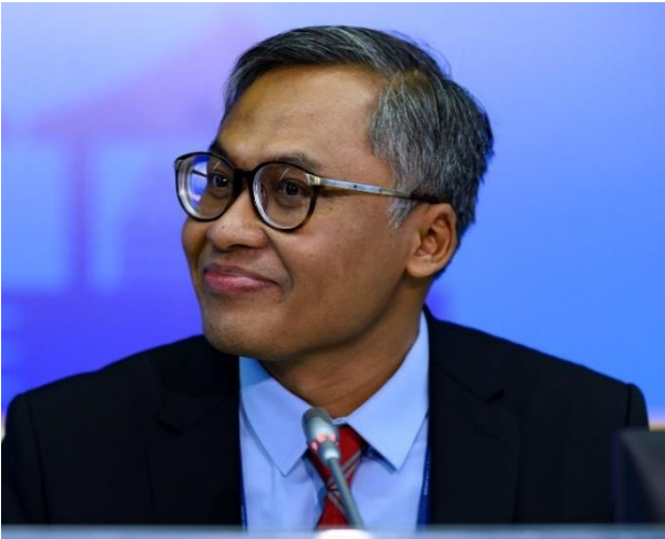
Mr Suminto Chairperson of the Governing Council Governor for the Republic of Indonesia