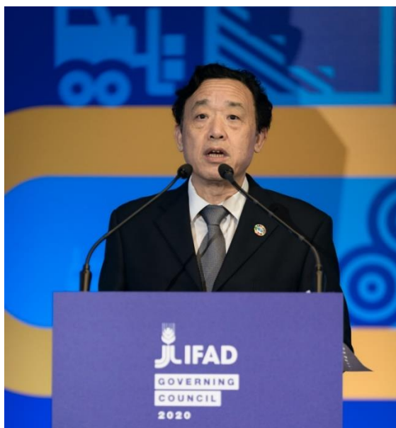
Mr QU Dongyu Director-General of the Food and Agriculture Organization of the United Nations