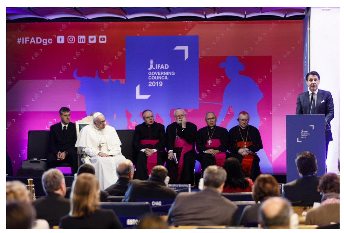
His Excellency Giuseppe Conte, President of the Council of Ministers of the Italian Republic