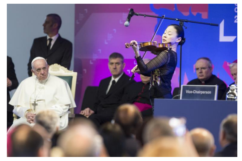
Midori, United Nations Messenger of Peace