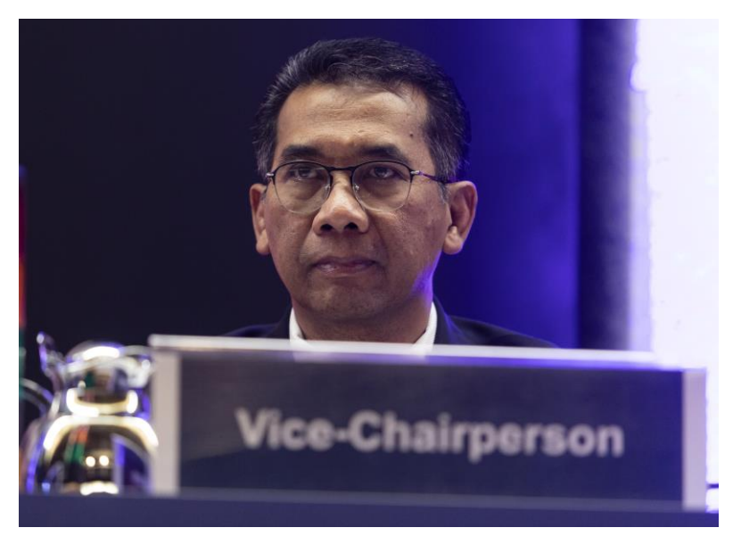
Mr Andin Hadiyanto Vice Chairperson of the Governing Council Governor for the Republic of Indonesia