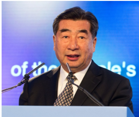
His Excellency Hui Liangyu, Vice Premier of the State Council of the People's Republic of China

Advancing Agricultural Development and Poverty Reduction Through Closer Global Cooperation