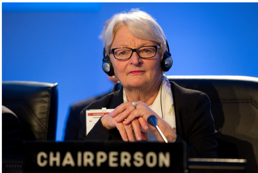
Her Excellency Marie-Josée Jacobs, Minister for Development Cooperation and Humanitarian Action of the Grand Duchy of Luxembourg