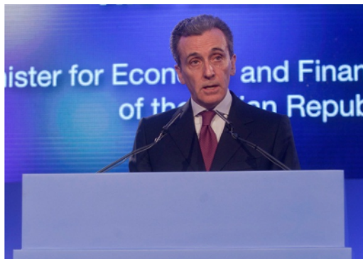
His Excellency Vittorio Grilli, Minister for Economy and Finance of the Italian Republic

Madam Chairperson, Mr President, Honourable Governors, Distinguished Delegates,