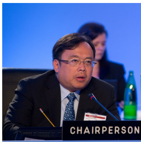
Mr Bambang Brodjonegoro, Director International Relation Policy, Fiscal Policy Office, Ministry of Finance of the Republic of Indonesia