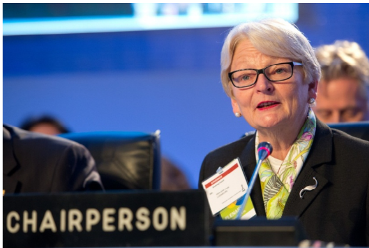
Her Excellency Marie-Josée Jacobs, Chairperson of the thirty-sixth session of the Governing Council of IFAD

Mr President, Excellencies, Honourable Governors, Ladies and Gentlemen,