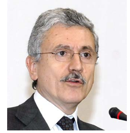
H.E. Massimo D'Alema, Vice-President of the Council of Ministers and Minister for Foreign Affairs of the Italian Republic