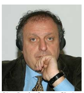
Hon. Pier Paolo Cento, Chairperson Under-Secretary of State, Ministry of Economy and Finance of the Italian Republic