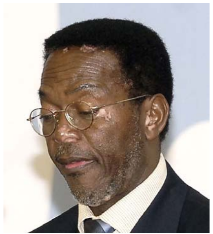
H.E. Jean Nkueté, Deputy Prime Minister and Minister for Agriculture and Rural Development of the Republic of Cameroon