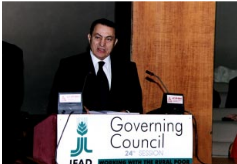
His Excellency Mohamed Hosni Mubarak, President of the Arab Republic of Egypt

5. The Governing Council was addressed by His Excellency Mohamed Hosni Mubarak, President of the Arab Republic of Egypt.