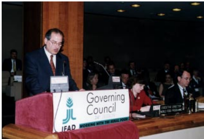
President Fawzi Al-Sultan

Disbursements have risen by 80% from their 1992 level to USD 312 million in 2000. This major increase in IFAD's disbursements reflects the attention and effort that have been given to ensuring that project implementation is carried out effectively and on a timely basis.