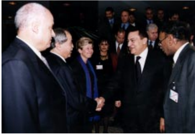
President Mubarak greeting members of the Bureau