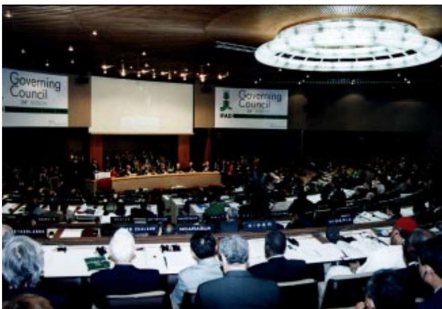
Plenary Session of the Twenty-Fourth Session of the Governing Council

34. The Governing Council approved the disclosure of documents approved at the Session and noted that they would be subsequently posted on IFAD's public website.