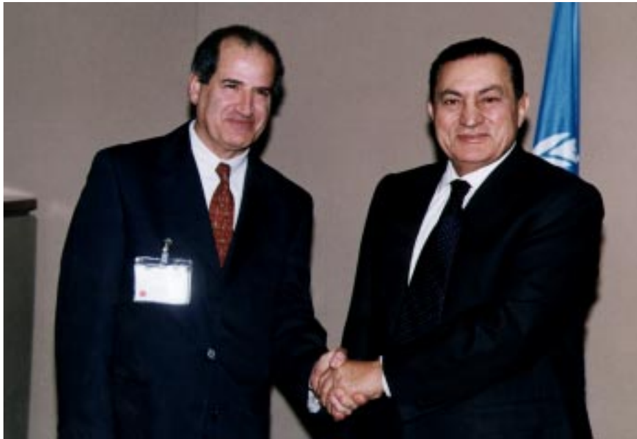
President Al-Sultan greeting President Mubarak