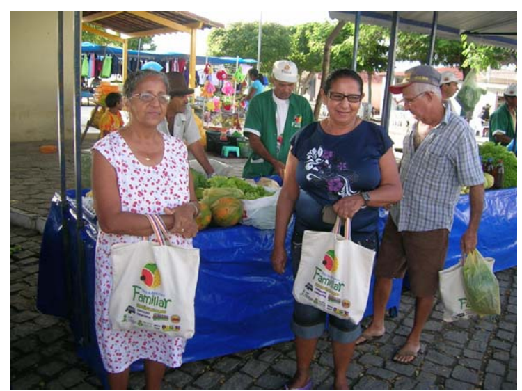
DHCP supported the creation of market fairs for family farmers.

121. Agricultural development diversification. The and 2009 impact survey showed that DHCP beneficiaries increased agricultural vields and substituted the low-value cassava crop with vegetables and plants for honey production. Overall, the survey showed higher average production volumes for 25 products, offsetting smaller reductions in 13 agricultural products. Maize and beans continued to be used as staple DHCP crops for families. Groundnuts, potatoes, bananas, guayaba (guava), capsicum and okra were introduced, often in response to increased participation in markets. This change in the cropping pattern was accompanied by an increase in productivity. land The most important factor contributing to