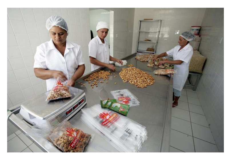
Upgrading of farm produce, for example by improving packaging and certification, is a necessary condition for the continuation of project benefits.

142. The experience of DHCP showed that to achieve sustainable results adequate support for farming families is required for a sufficient length of time. The project is advocating that during a possible second phase it disengages in the first year from the 5,000 families that have participated since 2003–2004. After this, DHCP-II would disengage from families targeted at later stages of implementation. In territories consistently and effectively reached for five years or more, such an exit strategy could be considered adequate, but a second phase would in any case be required to initiate the phasing out of DHCP support. Despite its long duration, DHCP expected a further phase of financing in order to exit from the first phase. Indeed, the DHCP strategy was to create the conditions for a second phase of financing. But relying on seamless continuation in a subsequent project is a risky strategy because an unexpected political change could halt the process. For more recently included families, further support is required to achieve sustainable improvements: this could not be provided in the timeframe of DHCP. In line with this rationale it can be argued that the expansion of the target group in the last few years was primarily driven by the objective of achieving the outreach objective of 15,000 families rather than by the idea of generating and consolidating sustainable results.