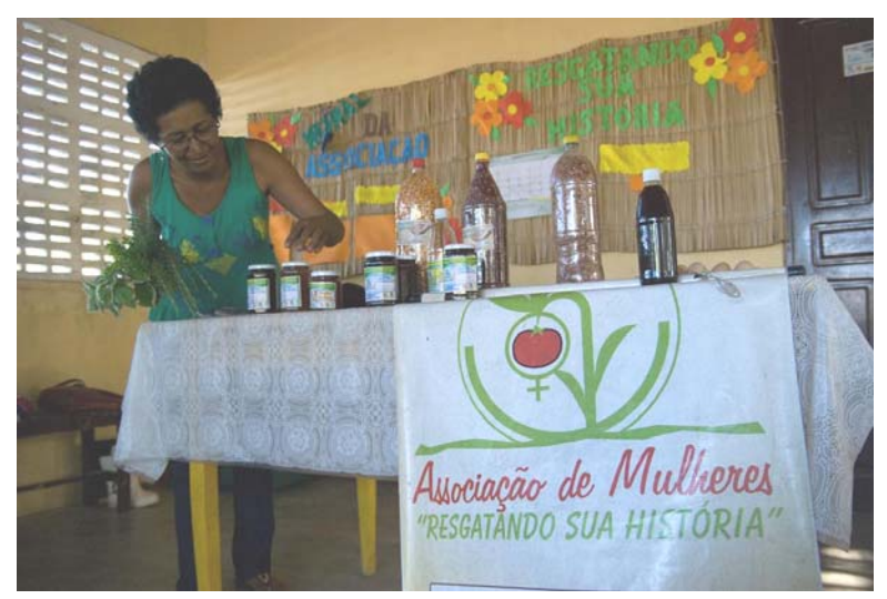
DHCP mobilized women in interest groups focused on selected production activities, with positive effects on their capacity to generate income.

116. Increased self-esteem among the rural poor and the empowerment of women. The evaluation noted the significant increase in self-esteem among the rural poor. This can be assigned to various factors: adoption of an effective participatory bottom-up approach, the focus on small-scale income-generating activities and the adoption of a pragmatic agenda for the empowerment of women. A significant number of farmers interviewed by the evaluation observed that before DHCP they were day-labourers with little prospect of advancement in life, whereas they now possess land, support their families and participate in local markets. The project empowered family farmers by considering them repositories of knowledge during the exchanges in various territories. The participation of beneficiary families and their organizations in municipal rural-development councils and in territorial committees also contributed to raising their self-esteem. The actions implemented by DHCP for market development enabled agrarian reform beneficiaries to experience for the first time formal agricultural market transactions, which also contributed to their empowerment and enhanced self-esteem.