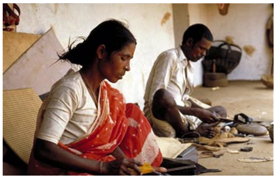
Picture 3: A traditional shoe-making family has received assistance from GCC to enlarge its family business.

44. Importance of vocational education . The demand for education in tribal areas has grown rapidly over the last decade, even in the absence of the necessary infrastructure and personnel. However, educational gains have not been matched by employment opportunities. The ashram schools, which are geared towards basic academic education, meet the overall mental- and social-development needs of the child but are not directly linked to post-school employment. Although these