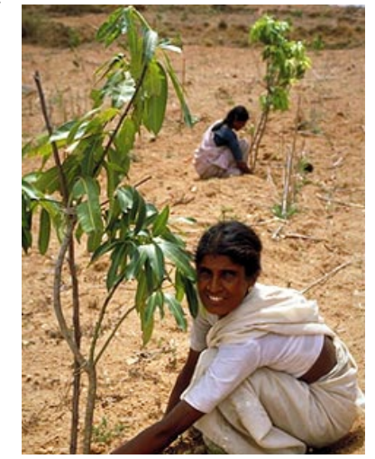
Picture 2: A project beneficiary weeds the basin around mango saplings.

problems, including poor maintenance of irrigation systems, a lack of sufficient know-how regarding horticultural techniques and, most significantly, increased vulnerability to drought because of the dependence on irrigated agriculture. The degree of change involved in the replacement of a tried and tested agricultural pattern by an approach requiring different techniques, different seasonal patterns and a different attitude towards natural resources must be recognized. For example, emphasis needs to be placed on preliminary research concerning the choice of horticultural crops in particular areas to determine which crops would be successful in given soil, altitude and climate conditions. Wherever radical agricultural transformation is being attempted, there is a vital need for training, guidance, adaptive research and strengthened extension services in order to support and sustain the transformation. The training of trainers is the first requirement of training programmes, and this must take into account the fact that the line department officials themselves may have little knowledge of either local conditions or tribal societies.