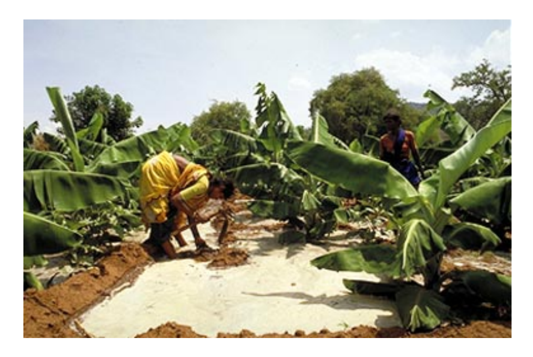
Picture 7: A woman beneficiary clears the irrigation canal which carries water to her plantation field.