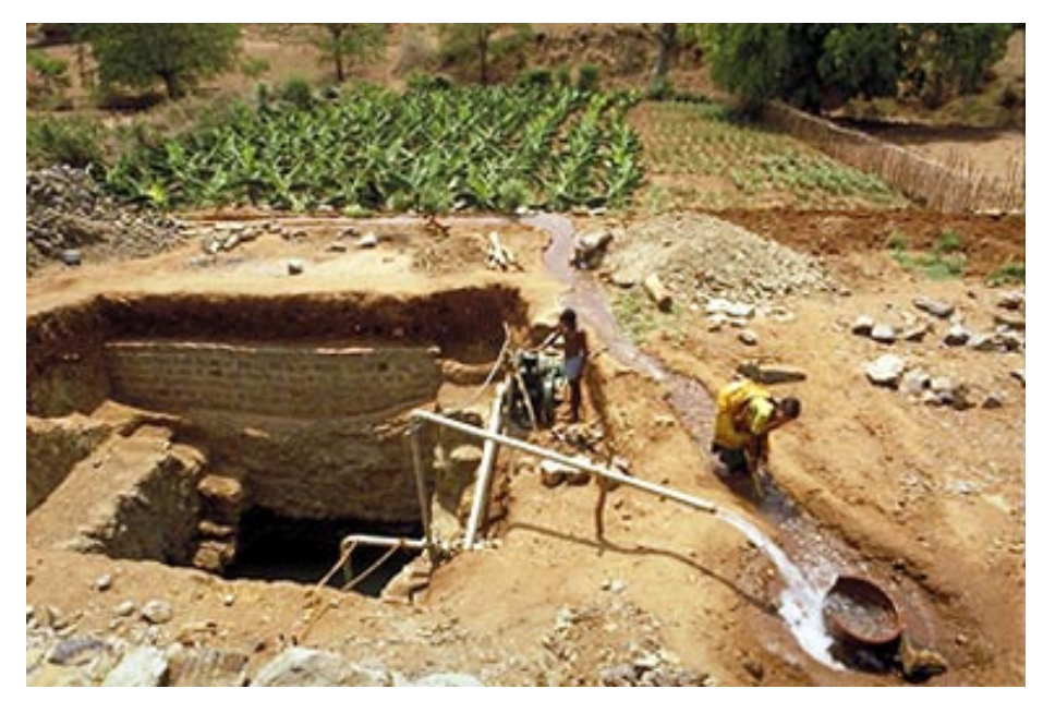
Picture 6: A view of the well where deepening and pipe-laying work is taking place.