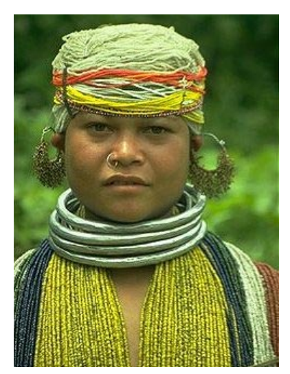
Picture 4: People from the tribal areas visit the market to sell their produce.

45. Health care . Community health workers have been one of the undoubted successes of the project. The basic training package is sound and should be refreshed and extended where possible. In particular, basic midwifery training should be included in all programmes, particularly in view of the resistance to institutional care among tribal women in certain places. The Government prohibition on