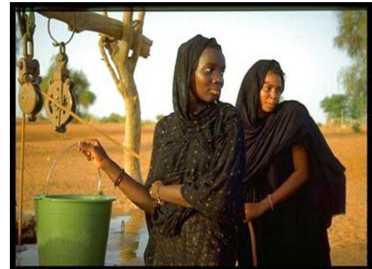
Mauritania, Agricultural Rehabilitation Programme II. Two women gather water from a well in the Al Aouja oasis in the Assaba Region

Potential cofinanciers: Discussions are ongoing with the Arab Fund for Economic and Social Development. The programme may be eligible for Global Environment Facility funding.