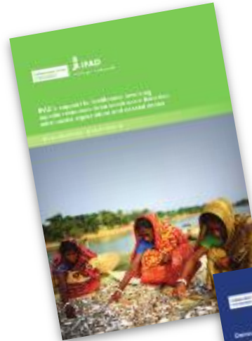
Project Performance Evaluations (PPEs)