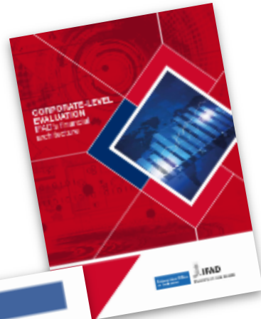
Corporate-level evaluations (CLEs)