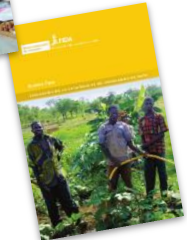
Country strategy and programme evaluations (CSPEs)