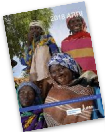
Annual Report on Results and Impact of IFAD Operations (ARRI)