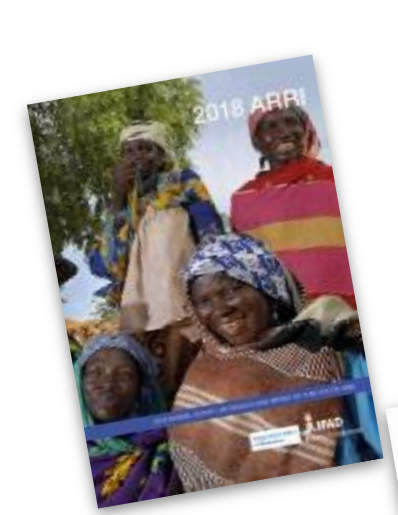
Annual Report on Results and Impact of IFAD Operations (ARRI)