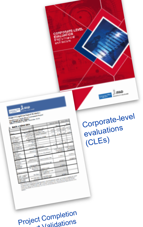
Project Completion Report Validations (PCRVs)